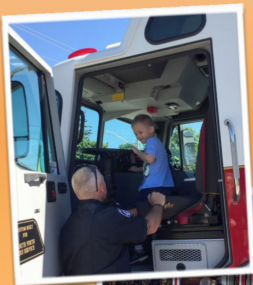
BOTTOM: The JK class' exciting field trip to the fire hall.