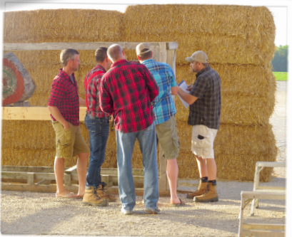
REDNECK GAMES AT THE BOARD & STAFF SOCIAL