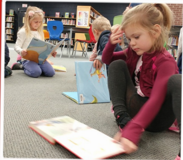
With many shelves full of books and lots of floor space to read them, students are enjoying their new library.