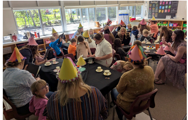
Grade 2 - Mother's Day Tea

~ This information will be emailed out to you ~