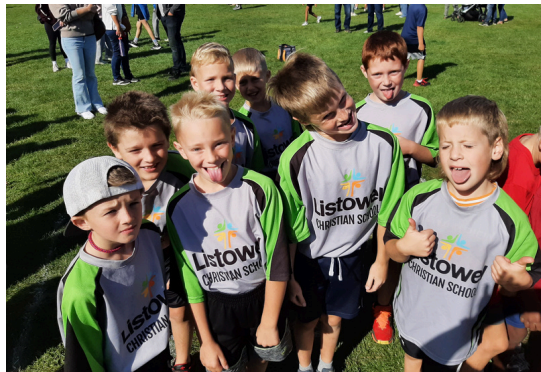
Cross Country Cambridge